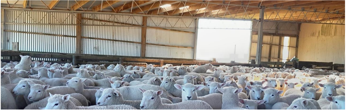
Lambs in the shed at Paua, ready for docking